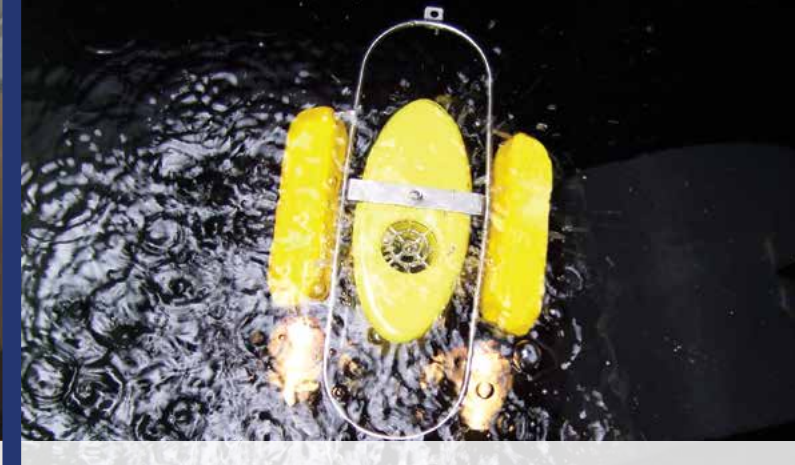
ROV entry via top hatch