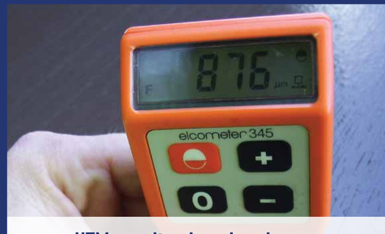
UTM results given in microns