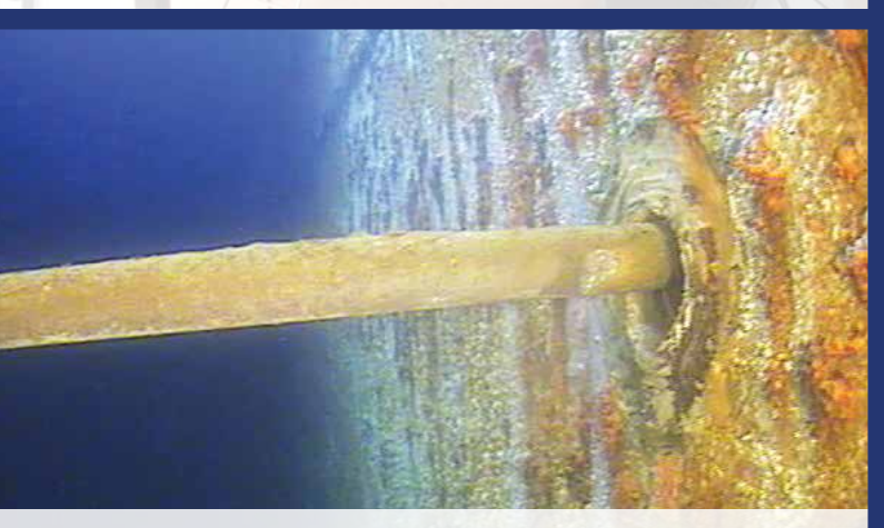
Corrosion discovered on tank panel