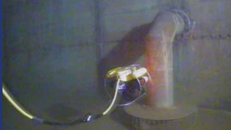
ROV inspecting ancillary items