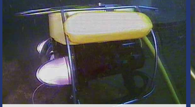
ROV navigating around the tank