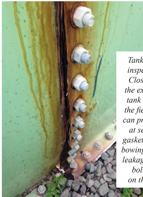
Tank without proper inspection program: Close inspection on the external parts of a tank that has been in the field for some time can present visible rust at seams, degraded gasket material, visible bowing in steel, signs of leakage, and rusted out bolts (shown here on the bottom ring).

For more information contact: Kimberly Mathis, Global Marketing Director, CST Industries, Inc., 498 N Loop 336 E, Conroe, TX 77301; (713) 351-3769, kmathis@cstindustries.com .