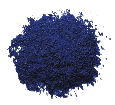
Glass frit is specially formulated to produce the distinctive cobalt blue Aquastore glass coating.