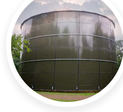
Ground Storage Tank