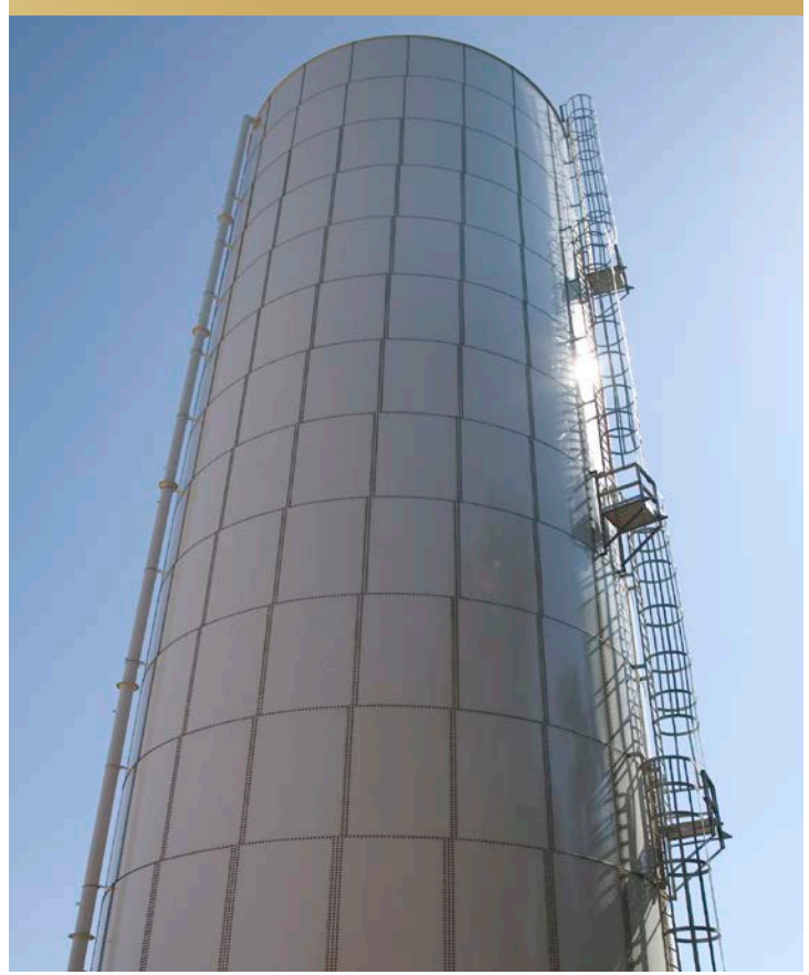
» Multiple Ladder Runs Shown on Epoxy Coated Tank