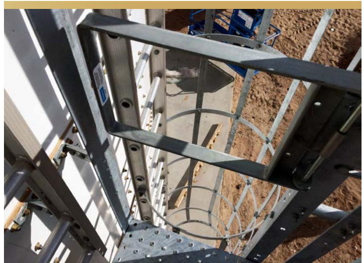
» Safety Gate

For more information about upgrading your ladders to the new OSHA regulations for 2018, call the experts at 844-44-TANKS or visit us online at www.cstindustries.com .