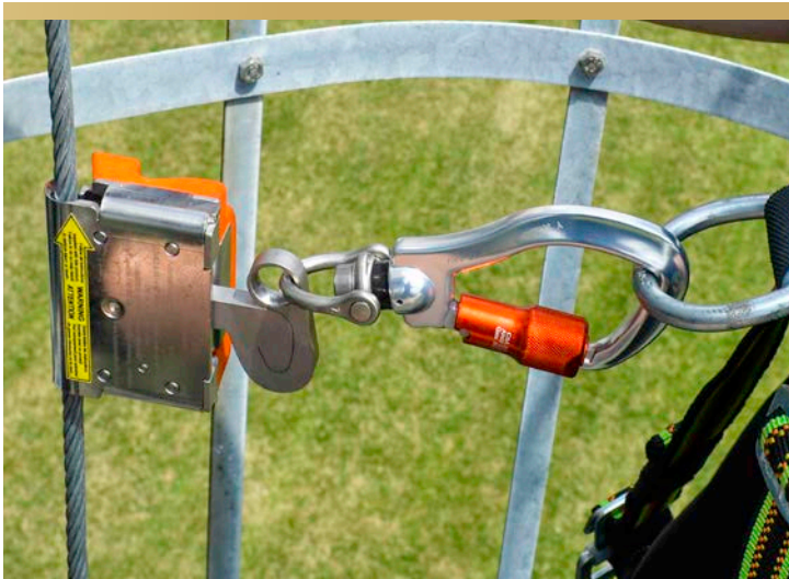
» Vi-Go Automatic Pass-Through Cable Sleeve and Cable Guide