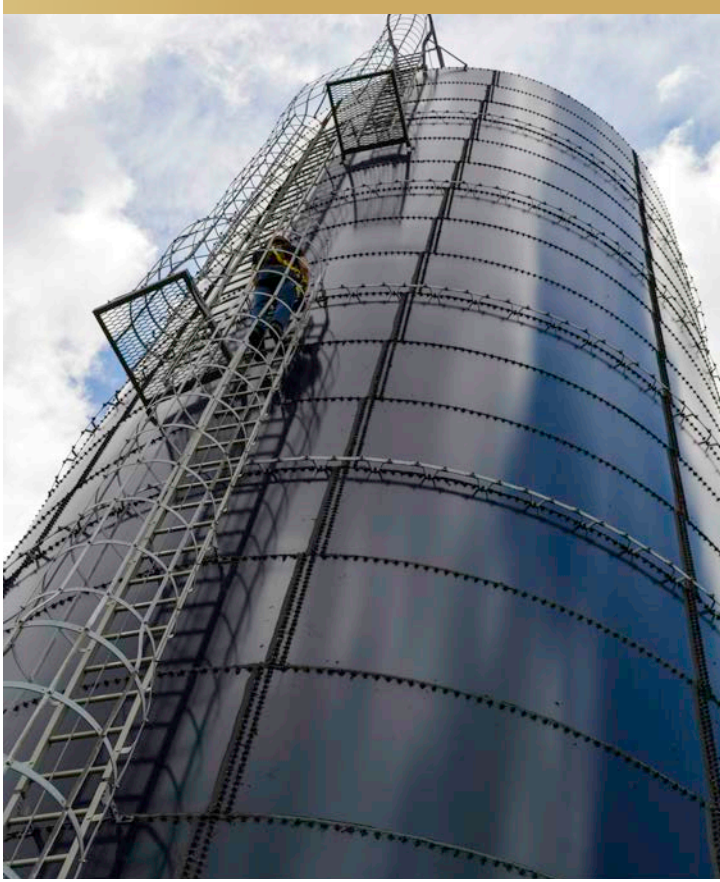
» Multiple Ladder Runs Shown on Glass-Fused-To-Steel Tank

» Reference the Below Figures to Complete the FREE QUOTE Form