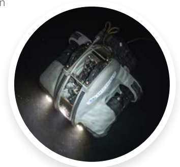
» CST's Underwater ROV Equipment

CST recommends having your epoxy coated water storage tank inspected every 3-5 years. Whether you need a periodic inspection, review of a structural concern, or analysis of your tanks service life, CST can fulfill your inspection requirements.