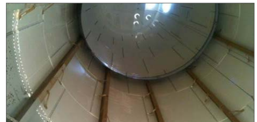
>> Hopper Replacement