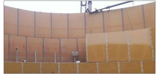
>> Corroded Staves Replacement

Call +1 844-44-TANKS or email us at services@cstindustries.com .