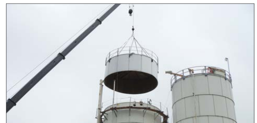
>> Roof/Top Ring Replacement