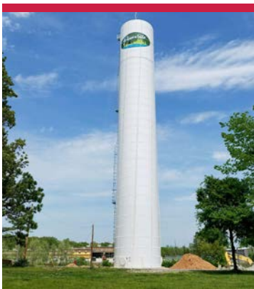
» Flat Panel Tank Systems

Every TecTank tank is manufactured in a factory-controlled environment. The result is precise steel panel production teamed with an optimized coating process. CST has invested millions in a completely modernized and automated fabrication line in our ISO 9001:2015 Certified facilities. This state-of-the-art operation delivers the best epoxy coated steel tanks available in the market.