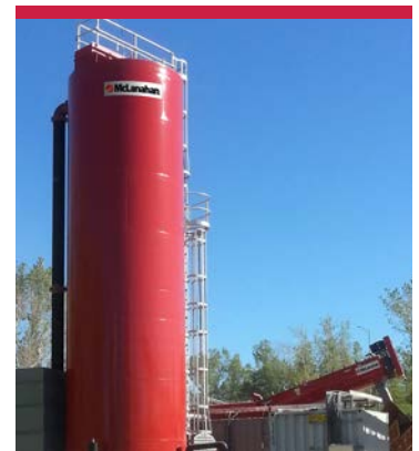
» Factory Welded Tank Systems

CST's TecTank product line delivers high-quality and durability at the best value per gallon, making TecTank tank systems the best choice for liquid storage applications.