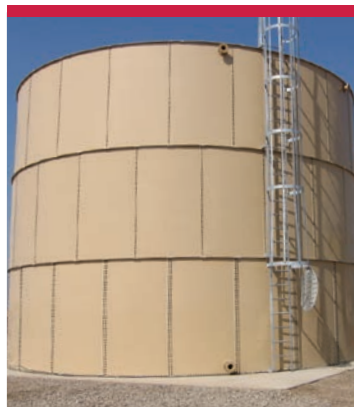
» Chime Panel Tank Systems