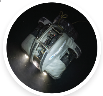
» CST's Underwater ROV Equipment

CST recommends having your epoxy coated water storage tank inspected every 3-5 years. Whether you need a periodic inspection, review of a structural concern, or analysis of your tanks service life, CST can fulfill your inspection requirements.