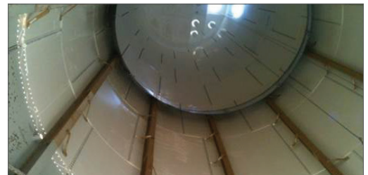
>> Hopper Replacement