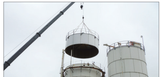
>> Roof/Top Ring Replacement