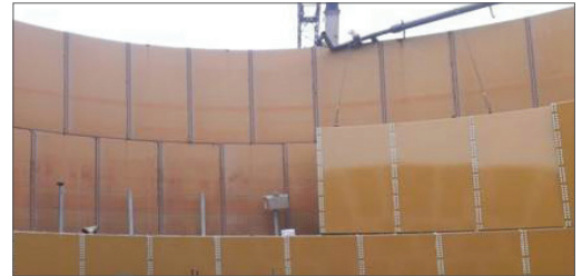
>> Corroded Staves Replacement

Call +1 844-44-TANKS or email us at services@cstindustries.com .